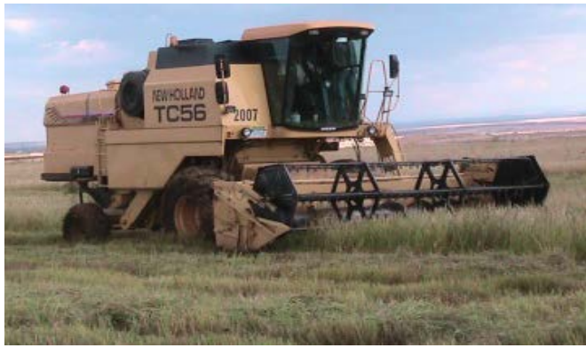
Figure 1. View of combine harvester operation in paddy field.

The conventional combine harvester is less suitable for rice harvesting. Therefore, before starting tests, in order to avoid of wrapping of straw and the clogging of sieve, rasp-bar threshing beaters were changed with spike tooth beater (Figure 2). Combine speed was determined for each plot by using stop watch to monitor time required to travel 35 m. Beater speed were setting of gears in the header drive unit. Header and hood height were regulated with hydraulic system in the combine cab. Field experiments were replicated three times at each plot (Chegini, 2013). The operating parameters of combine harvesters during the rice harvesting were chosen as 750-800 rpm beater rotational speed, 750 rpm fan speed and 20-25 cm high of plant. Combine ground speeds of 3.2 km h -1 was determined. The reel speed was automatically synchronized to ground speed.