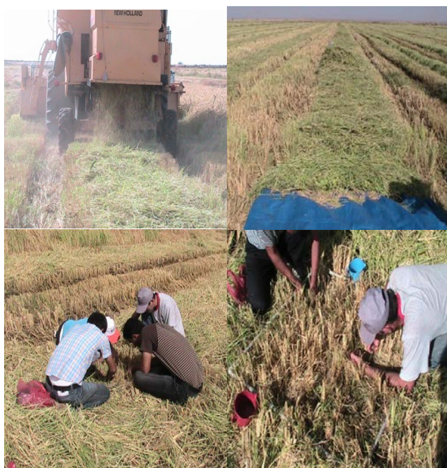
Figure 4. Measurements of rice grain losses in paddy field.