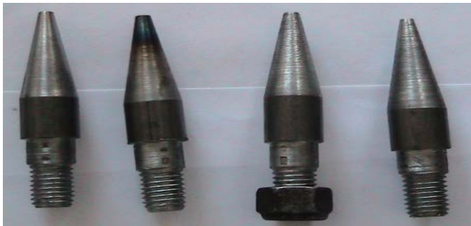
Figure 2. A spike- tooth that used for threshing unit.

The conventional combine harvester is less suitable for rice harvesting. Therefore, before starting tests, in order to avoid of wrapping of straw and the clogging of sieve, rasp-bar threshing beaters were changed with spike tooth beater (Figure 2). Combine speed was determined for each plot by using stop watch to monitor time required to travel 35 m. Beater speed were setting of gears in the header drive unit. Header and hood height were regulated with hydraulic system in the combine cab. Field experiments were replicated three times at each plot (Chegini, 2013). The operating parameters of combine harvesters during the rice harvesting were chosen as 750-800 rpm beater rotational speed, 750 rpm fan speed and 20-25 cm high of plant. Combine ground speeds of 3.2 km h -1 was determined. The reel speed was automatically synchronized to ground speed.